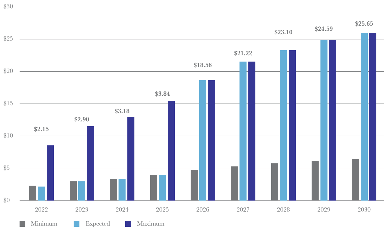
SB 704 Expected Savings per Year (Millions)

Based on our estimates of the prison population reduction, we calculated a range of possible fiscal savings from a reduced prison population using an average cost figure ($18,939/year) based on an estimate of the security level of individuals impacted by SB 704 1 and a marginal cost figure ($4,726/year). 2 See the Methodology section for more information on how cost savings were estimated.